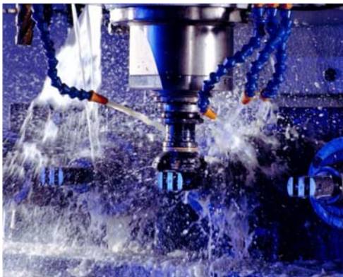
Refractometer Factor = 2.5